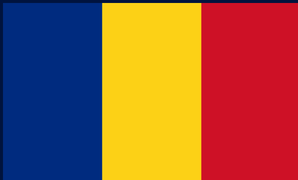
The flag of Romania